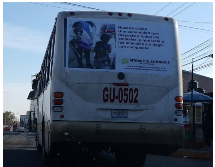
This bus message states, "Our vision: a community that respects all animals, and that treats homeless animals with compassion."

With a US grant that we received in December of 2014, we renewed a contract with the firm Publimovil to produce 12 vinyl public-service messages on the backs of three city buses and inside 30 city buses for 12 months. The messages described our vision, encouraged the adoption of homeless dogs and cats, and promoted responsible and humane treatment of pets. Each was displayed for three months and seen by an estimated 10,000 people a day.