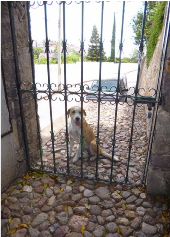
Vanilla outside my gate

It was also the last straw. There had been too many dead puppies over the years, and now Dos Ojos. All of Vainilla's remaining puppies, four females and one male, died of distemper. Without her mate or her babies, Vainilla began sitting outside my gate every day to be near what was left of her family, and I renewed my efforts to catch her.