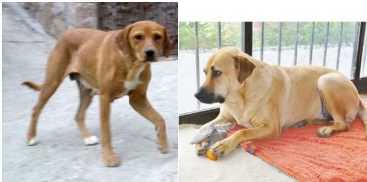
Canela and Casey

In my last article for the December 2012 Newsletter , I recounted my efforts to help two female dogs in my Guanajuato neighborhood, a mother and daughter, who gave birth to new litters every six months. Though I originally had no intention of keeping them, I ended up adopting the mother, Canela, and her brother, Casey.