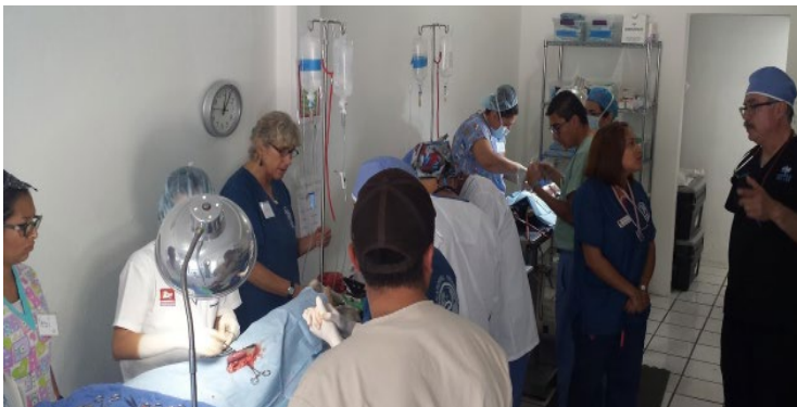
Veterinarians at the sterilization workshop in Manzanillo