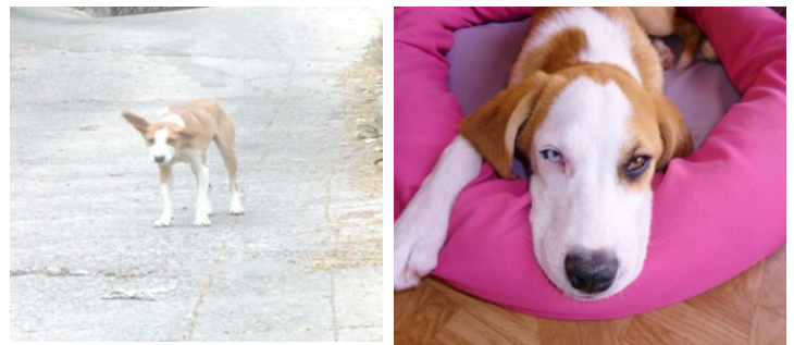
Vanilla and her puppy Daphne