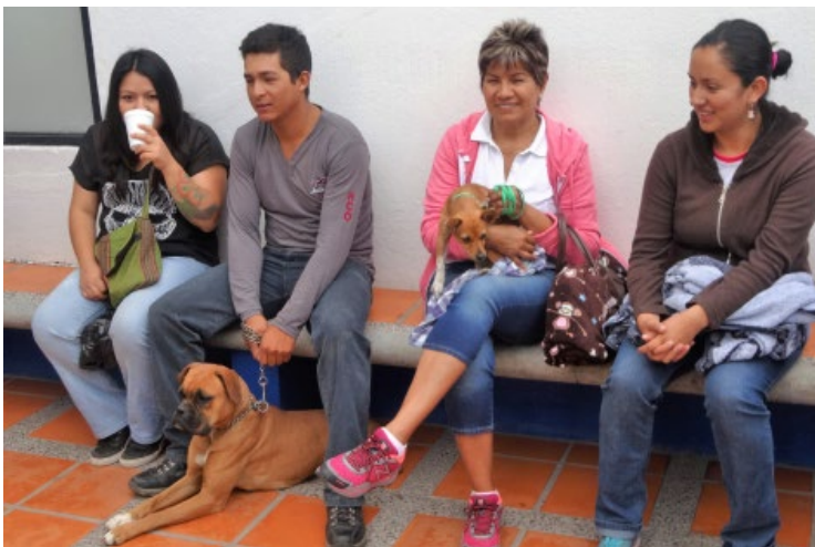
People waiting for their dogs and cats to be sterilized at the Secretariat of Health, October 2015

With veterinarians from the Secretariat of Health, we conducted 45 campaigns in 17 locations, sterilizing a total of 1,301 animals and averaging 28.9 cases per campaign. Each month at least two campaigns took place at the headquarters of Secretariat of Health in the city of Guanajuato. The others were held in the city's suburbs and nearby communities. By the end of the year, Amigos had sponsored or co-sponsored 155 sterilization campaigns since December of 2001, totaling 6,728 cases. The total number of cases (in campaigns and clinics) from 2001 was 12,106.