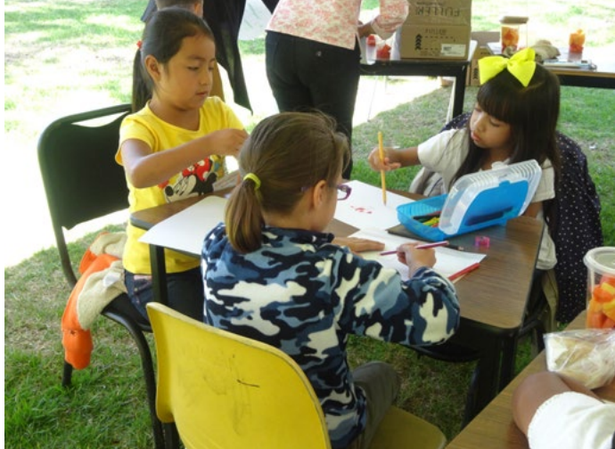
Children of miners received copies of the story "Two Lucky Puppies" at Mina de Cata

campaigns, and to children of the miners at the Mina de Cata and children at Colegio Lolek in Marfil. We planned to develop a more extensive education program school at the primary school level, but fell short of our goal. We are making a more concerted effort this year.